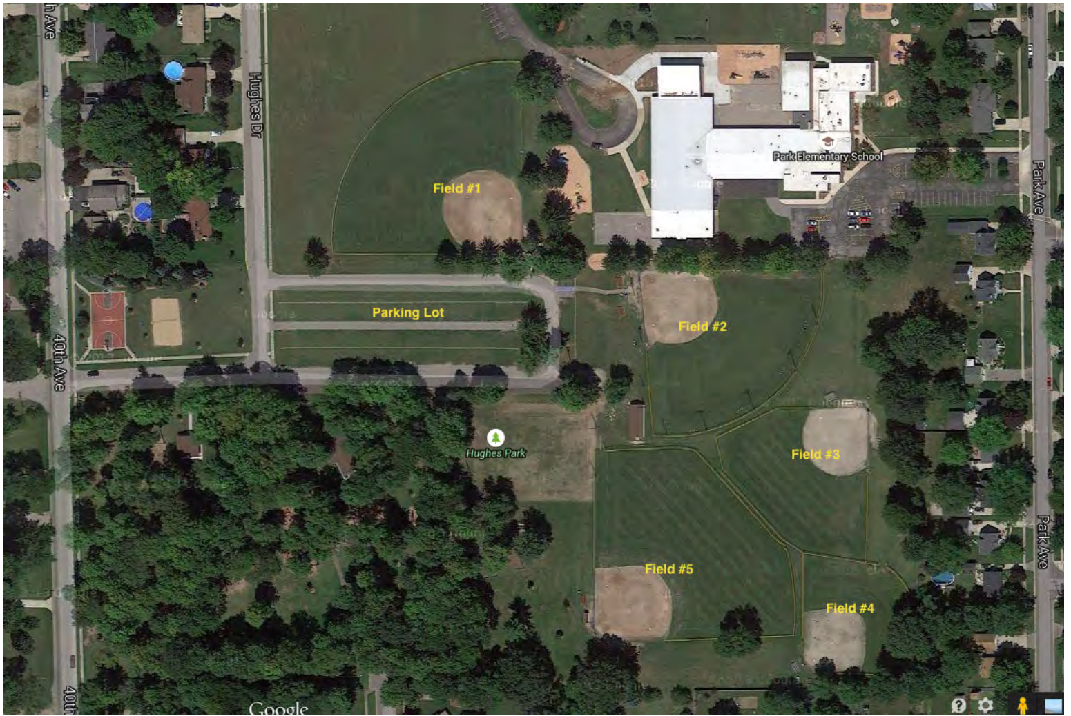
Hughes Park 40th Ave & Van Buren St, Hudsonville, MI 49426